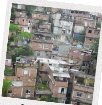
Room with a view

In the morning the sound of cockerels persuades you that you are on a Norfolk farm. At night, very different noises compete: the pastor of the Pentecostal Church screams down the Holy Spirit on his ecstatic congregation and a DJ blasts out the sexually-explicit lyrics of the latest favela funk anthem. Children spend their day flying handmade kites from rooftops. It makes me wonder whether my own fragile project will take to the air. Am I just like Mary Poppins come down from the clouds in response to a request for help only to fly away one day?