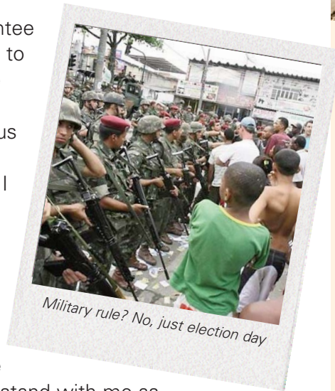
Military rule? No, just election day

I was licensed Priest Missioner at the start of October. It was local Election Day and the climax of a long campaign to choose a new mayor for Rio de Janeiro. I walked to church through chaos and confusion on the streets past hundreds of soldiers carrying guns who had been drafted in 'to guarantee the democratic process'. I'd hoped to buy some roses to brighten up the church but the flower-seller had abandoned his stall. Cidade de Deus felt like a tinderbox that could explode at any moment. The most I had ever feared on polling day in the UK were the tellers asking me for my name and address. Now I wondered just how much it might take a soldier to pull his trigger, no questions asked. In the end, two people were shot. Thirty brave souls made their way to church to stand with me as I made my promises. We sang 'Make me a Channel of your Peace'. I prayed someone was listening.